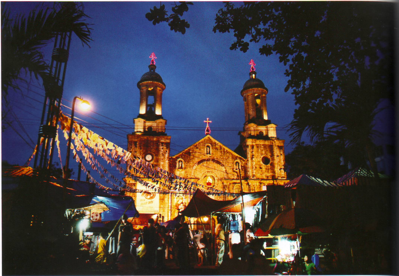
CITY OF FAITH: San Sebastian Cathedral, built in 1876, is said to have been made of materials sourced from Palawan, as well as coral stones from Guimaras. Right beside the church is the Bishop's Palace built in 1830.